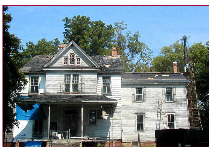
82A-034 Ellerslie Site 6700 Green Grove Place Upper Marlboro vicinity

Built circa 1820, possibly earlier wing—Sasscer's Green was a small, one-and-one-half-story, side-gabled frame house of side-hall-and-double-parlor plan; it had freestanding chimneys, an attached kitchen wing, and fine early nineteenth-century decorative detail. The main block was built circa 1820 by Thomas Sasscer. It was a fine example of a small southern Maryland plantation house, transitional between the Federal and Greek Revival styles, but was severely damaged by fire and demolished in 2006.