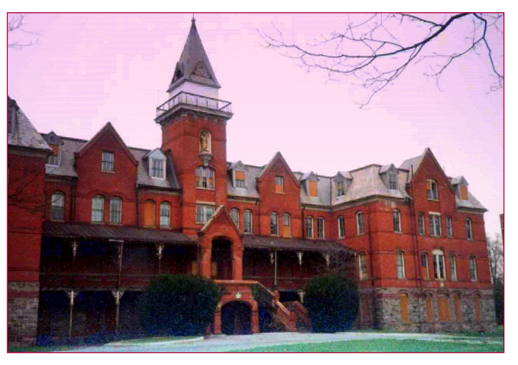
60-004 Ammendale Normal Institute Site (NR) 6011 Ammendale Road, Beltsville

The historic buildings that stood on the properties of the following designated historic sites have been lost. They were either demolished after salvage proved impractical or accidentally destroyed by fire. The properties on which they stood are still designated historic sites, and are protected by the Historic Preservation Ordinance.