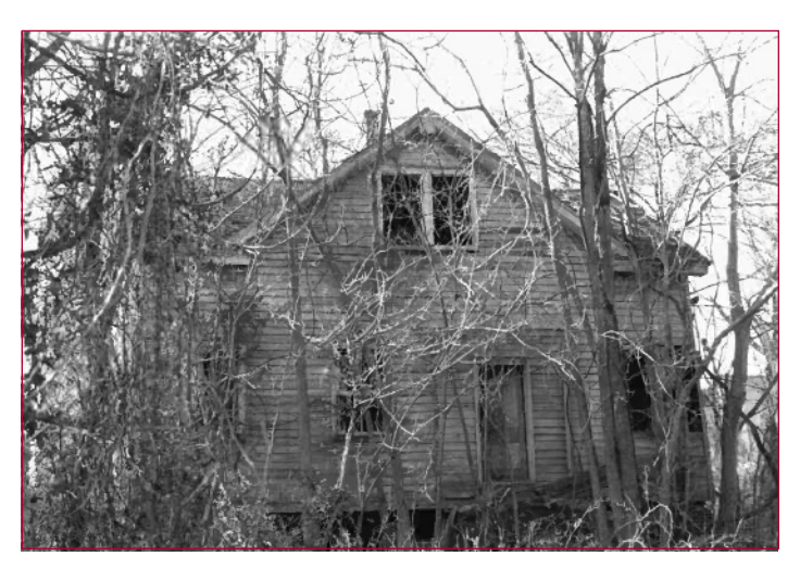
86B-004 Skinner Family Cemetery at Mansfield Site Cheswicke Lane Croom

The Skinner Family Cemetery at Mansfield is the only remaining feature of the large nineteenth-century Skinner family plantation. The original site of Mansfield comprised Dr. John H. Skinner's late nineteenth-century house, the family cemetery, and at least four agricultural outbuildings. After the house and outbuildings were deemed ruinous and beyond salvage, the family cemetery was designated as a historic site. The cemetery, with its Victorian iron fencing and large trees, contains at least seven flat horizontal tombstones, with full-size slabs inscribed with the names of members of the Skinner family.