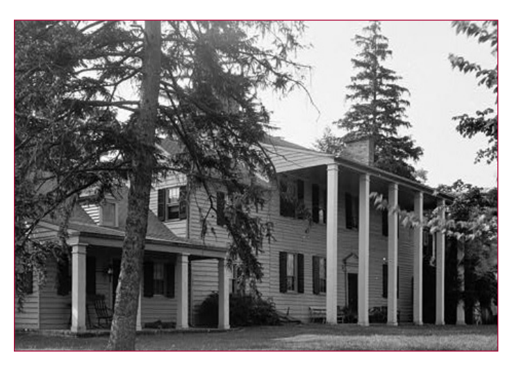
80-002 Salubria Site (18PR692) Oxon Hill Road Oxon Hill