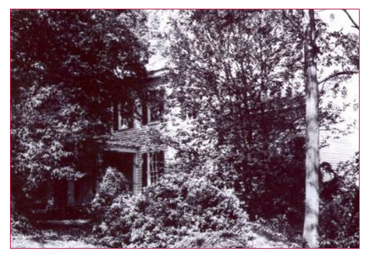
73-009 Rose Mount Site 9600 Landover Road Landover

The Warington Barn was built in the mid-nineteenth century and was a gable-on-hip roof frame tobacco barn; the long side sheds were original while the shorter end sheds were added later. The land on which it stood is Warington, owned for over a century by the Waring family; the Waring house was replaced by Captain Newton H. White's Regency Revival mansion at Enterprise Farm in 1939 (see Historic Site 73-006). The Warington Barn was destroyed by high winds in 2007, and until then it was the best surviving example of its type in the county.