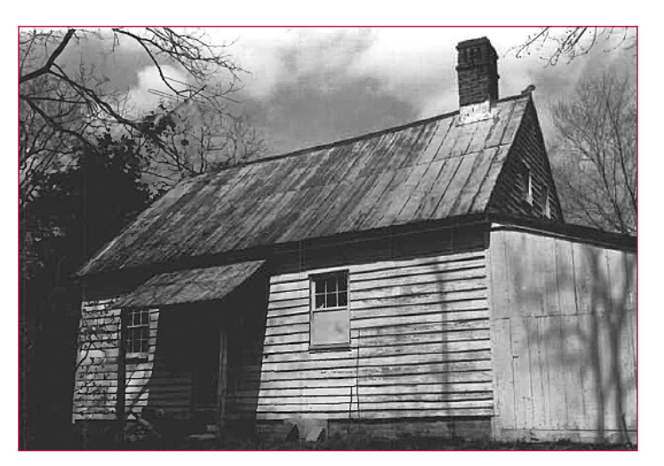
76A-001 Ridgeway House Site 3915 Summer Road Suitland (M-NCPPC)

Built in the eighteenth and nineteenth centuries, this site includes foundations of the Northampton plantation house, and ruins of one frame and one brick two-family slave quarter, shown above in a 1936 photograph. The plantation house burned down in 1909. The quarters existed until 1950. Northampton is an important archeological site; it represents the home of Osborn Sprigg, prominent Revolutionary patriot, and Samuel Sprigg, Governor of Maryland from 1819–1822. It was also home to several generations of slaves and freedmen from the Northampton plantation. The stone and brick foundations of both the frame and brick quarters have been preserved and are interpreted in a park setting.