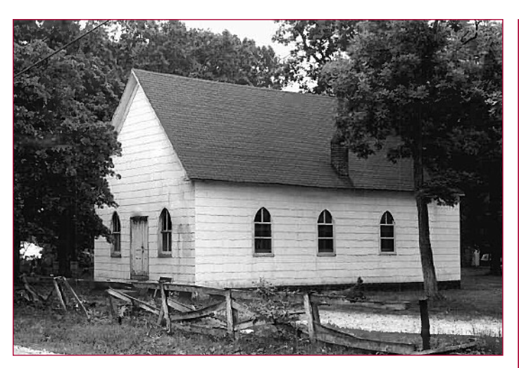
77-012 St. Luke's Church Site and Cemetery Dower House Road West and Leapley Road, Upper Marlboro

The cemetery contains 47 marked graves that date from 1903–2003; the markers vary by type and materials, and include concrete and slate tablets, granite headstones, marble tablets on concrete bases, concrete obelisks, concrete footstones, and headstones. St. Luke's Church, also known as Niles Chapel, was first constructed in 1868 as a Freedmen's School on land donated by William Niles, a white landowner in the area. Services were held in the schoolhouse until a chapel was built c.1877; this log building was replaced in 1893 by the frame building shown above which was demolished after 1974, when this photo was taken.