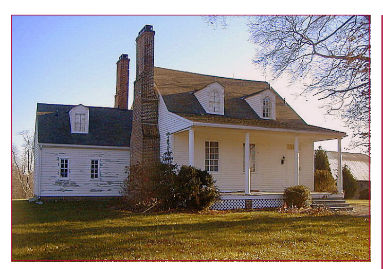
82A-009 Sasscer's Green Site 7108 Southeast Crain Highway Upper Marlboro vicinity

Built circa 1820, possibly earlier wing—Sasscer's Green was a small, one-and-one-half-story, side-gabled frame house of side-hall-and-double-parlor plan; it had freestanding chimneys, an attached kitchen wing, and fine early nineteenth-century decorative detail. The main block was built circa 1820 by Thomas Sasscer. It was a fine example of a small southern Maryland plantation house, transitional between the Federal and Greek Revival styles, but was severely damaged by fire and demolished in 2006.