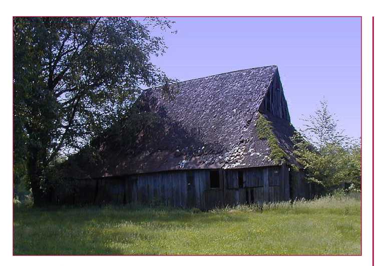
73-006 Warington Barn 2708 Enterprise Road Mitchellville (M-NCPPC)

The Warington Barn was built in the mid-nineteenth century and was a gable-on-hip roof frame tobacco barn; the long side sheds were original while the shorter end sheds were added later. The land on which it stood is Warington, owned for over a century by the Waring family; the Waring house was replaced by Captain Newton H. White's Regency Revival mansion at Enterprise Farm in 1939 (see Historic Site 73-006). The Warington Barn was destroyed by high winds in 2007, and until then it was the best surviving example of its type in the county.