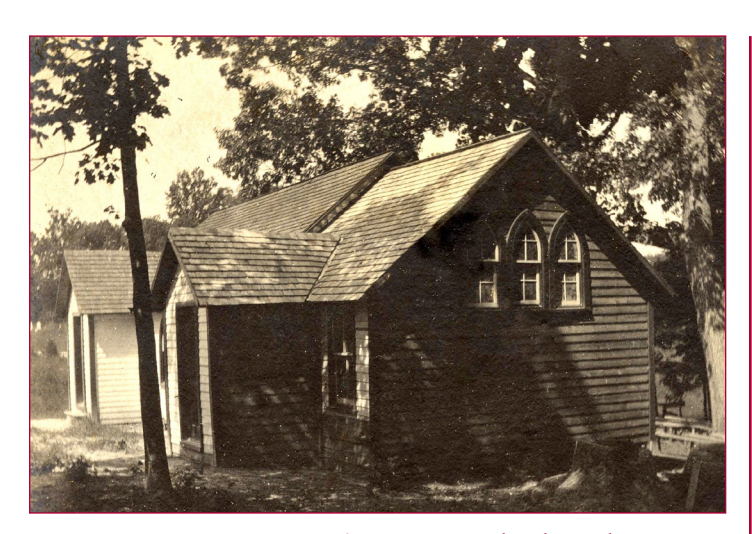
86A-012 Saint Simon's Episcopal Church Site and Cemetery Saint Thomas Church Road Croom

St. Simon's Chapel was a frame building with two vestibules and tripartite lancet sash windows in the gable ends. It was constructed c. 1894 on the grounds of St. Thomas' Episcopal Church Rectory, and was moved to the south side across St. Thomas Church Road to the present site in 1902. St. Simons Chapel was closed in 1964 and stood vacant until it was demolished in 1974. The cemetery is located approximately one-quarter mile south of Saint Thomas Church Road. There are approximately 70 marked graves and an unknown number of unmarked graves in the cemetery. The earliest grave marker identified is dated 1929. (Photograph taken before 1903, courtesy The Reverend Francis P. Willes, St. Thomas' Parish Archives.)